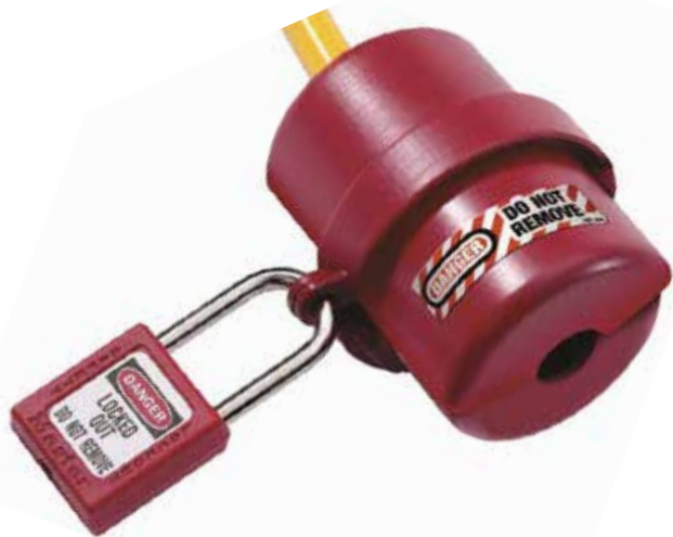
Plug Lockout Small 120 & 240 Volt Plugs | 0487

100 x 110 x 70mm | Padlock NOT Included Part No. H102183