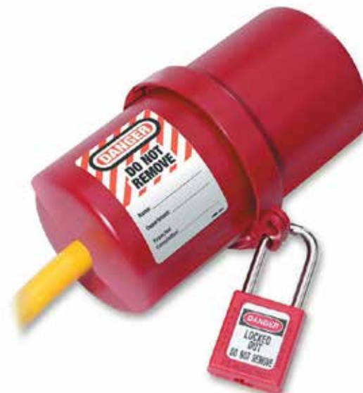
Plug Lockout Small 240 & 250 Volt Plugs | 0488

190 x 130 x 90mm | Padlock NOT Included Part No. H116687